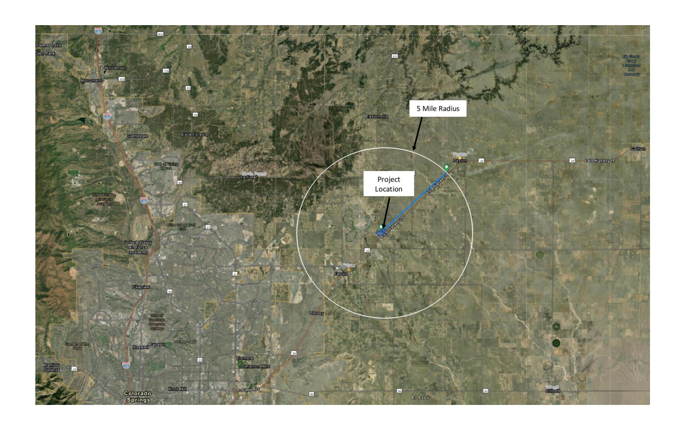
EXHIBIT A.1: VICINITY MAP